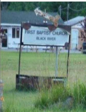
New Sign On Its Way!

We praise the Lord that July has been our best month so far. When I accepted the call to First Baptist Church on May 31 st , there were only two members, both college age girls, one who is just home for the summer. My first several weeks as pastor, we never had more than three adults in the service besides my wife and me. However, on July 5 th , we had 17 in attendance, our highest up until then. On the 12 th , we had 21 in church. There were more first time visitors that Sunday than regular attendees! On the 19 th , we had another record-breaking Sunday with 31 in the service. Last Sunday the 26 th , we had 23 in attendance, and all visitors were repeat visitors. In addition to God blessing us with visitors, we had our first family join this month. We are looking forward to serving the Lord together with them.