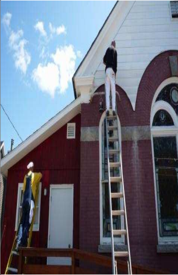
Help Arrives From Heritage Baptist

Our junior Sunday school had a shower in the back of the room. We managed to tear out the shower with only minor flooding. The class room has since been painted and reorganized. Our nursery, as well, has been painted, and, with new furniture added, is looking very presentable.